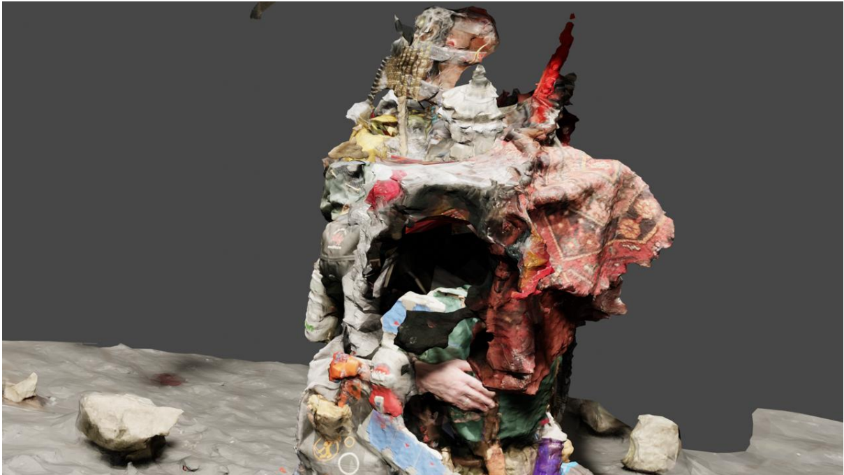
Still from animation: The warriors melted together

"Norwegian folklore blends with transformers and samurai aesthetics."